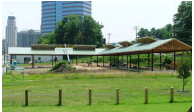
Durham Farmers' Market Pavilion as of July 10, 2006

A culinary reputation like Durham's is a key ingredient wrapped by DCVB into the destination's overall identity and involves noted chefs and restaurants , festivals , local coffee roasters , bakeries , farms and markets , locally/regionally grown foods , and vineyards and wineries .