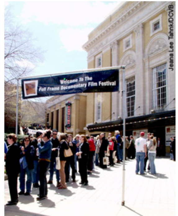
Downtown's Carolina Theatre was one of six Durham performing arts venues whose combined attendance was up 21.8% last year.

In its role to not only draw visitors but also get them to circulate within Durham, DCVB collaborates with 45 facilities and events to monitor overall attendance trends. For most visitor features and events, more than 50% of attendance is from non-residents. The Bureau also works with Opinion Research Corporation to track national perceptions of Durham as a place with “many cultural, educational, and entertainment features.”