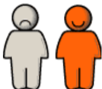
Image Is Strong at Home and Nationally, But Weak In Neighboring Communities

Durham has a strong image nationally and among Durham residents. Research pinpoints that any image issues stem from opinions among residents in a 100-mile radius.