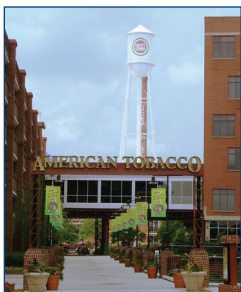
American Tobacco Campus

2828 Duke Homestead Rd • 477-5498 www.dukehomestead.nchistoricsites.org