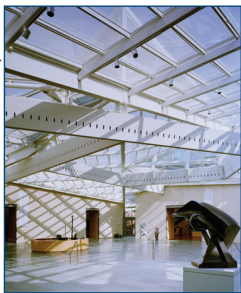
Nasher Museum of Art at Duke University