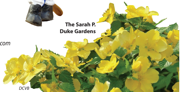
The Sarah P. Duke Gardens